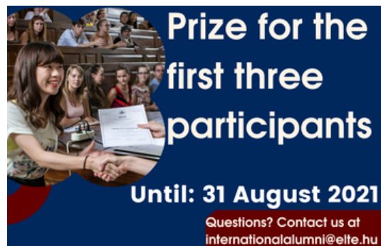
Photo contest for graduates

Celebrate your graduation with photos, and win a tablet or ELTE gifts. Upload your pics, and collect likes until 31 August.